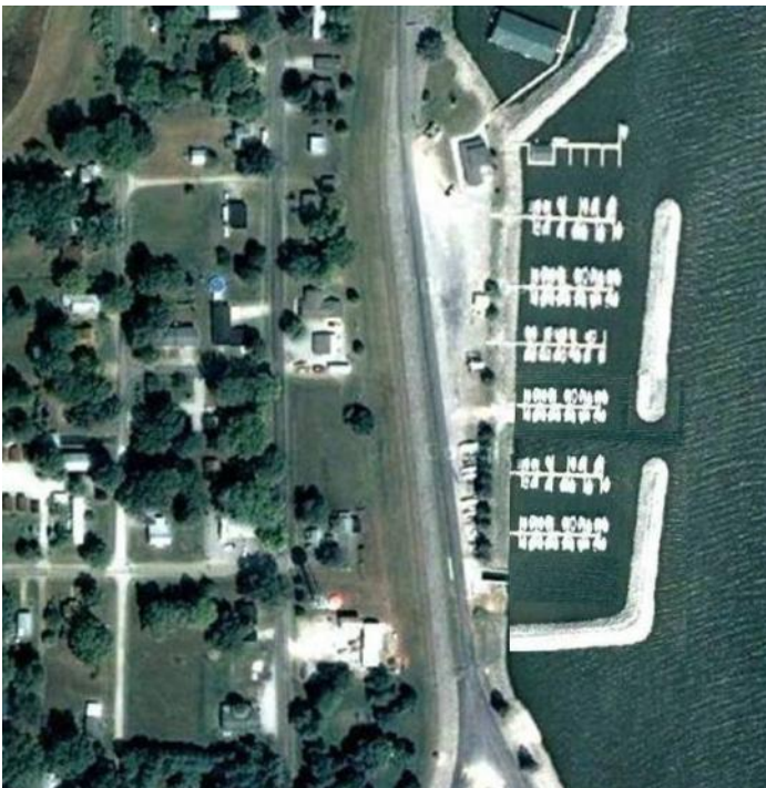
Notional future view of the open harbor (Google Satellite view altered by Lee Högman)

When the harbor breakwaters are finished, the new docks will start being installed. The new docks will be identical to our current docks - main docks from