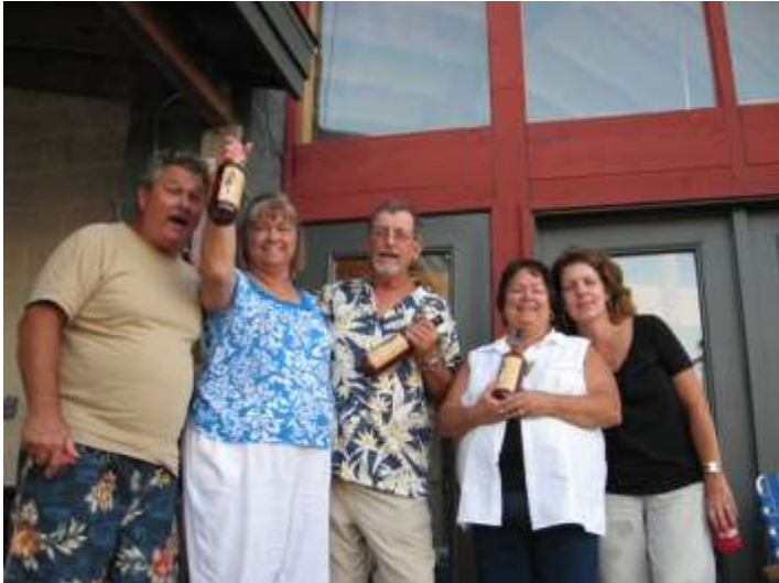
Boat Show

The TYC Boat Show and Poker Run was held on