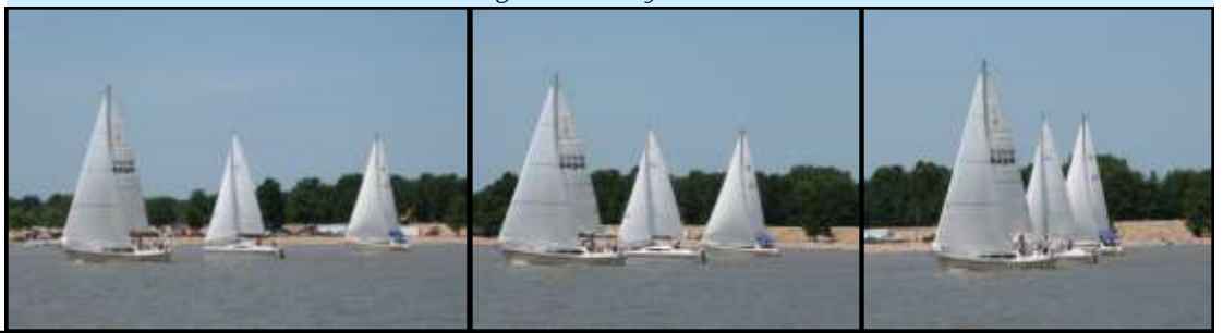
TYC Racing

Drivelswigger - one who reads about nautical terms too much